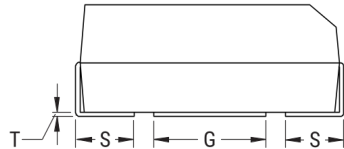
ANODE (+) END VIEW